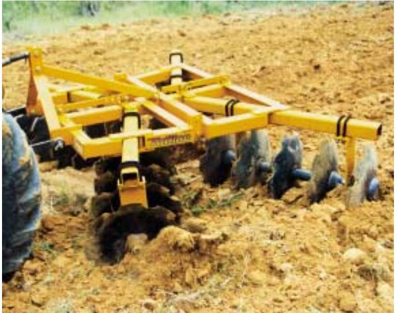
Model THF92020 BF - The THF Series offer a fold over frame for a heavy front gang cut or hinged floating rear gangs for a smoother finish.