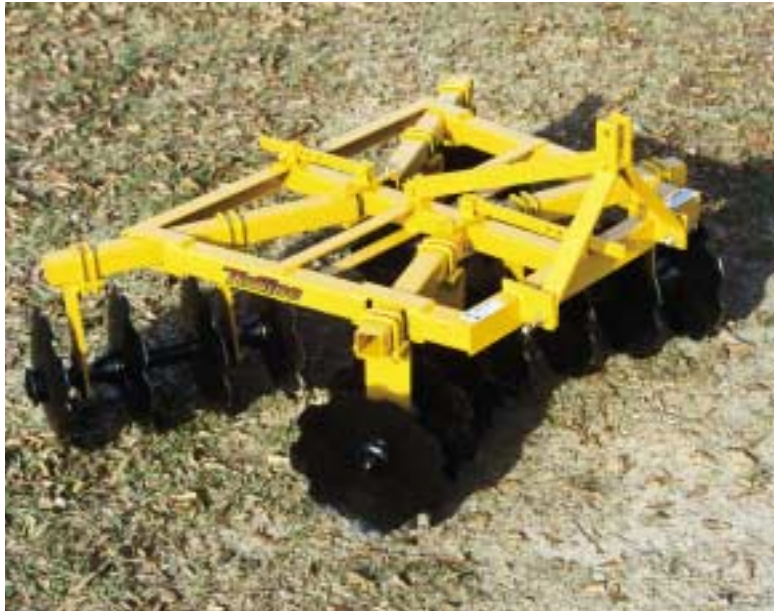
Model TH91620 BF - The TH Series with Flangett mount bearings (BF) is ideal for garden preparation. Pillow back mounts are available for more rugged applications

SPECIFICATIONS SUBJECT TO CHANGE WITHOUT NOTICE